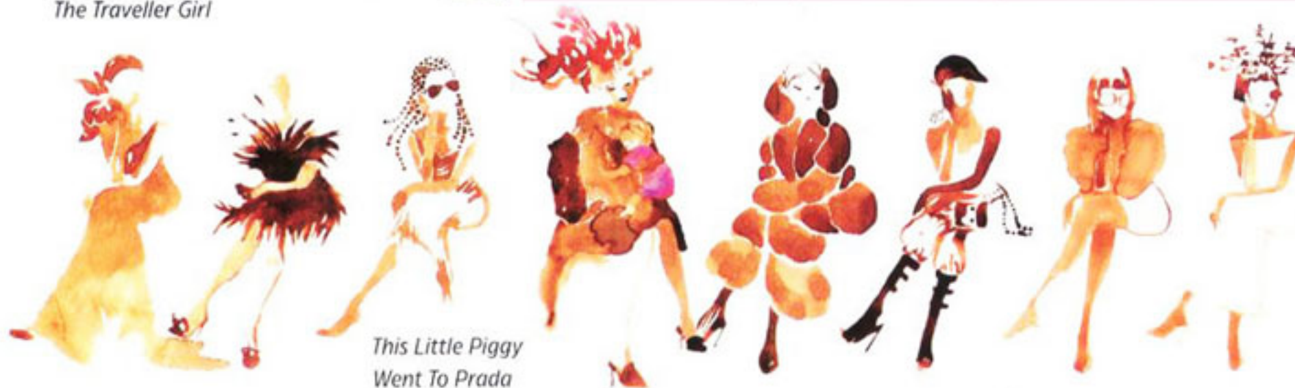
This Little Piggy Went To Prada