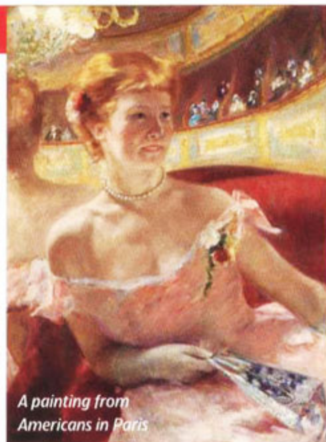
A painting from Americans in Paris